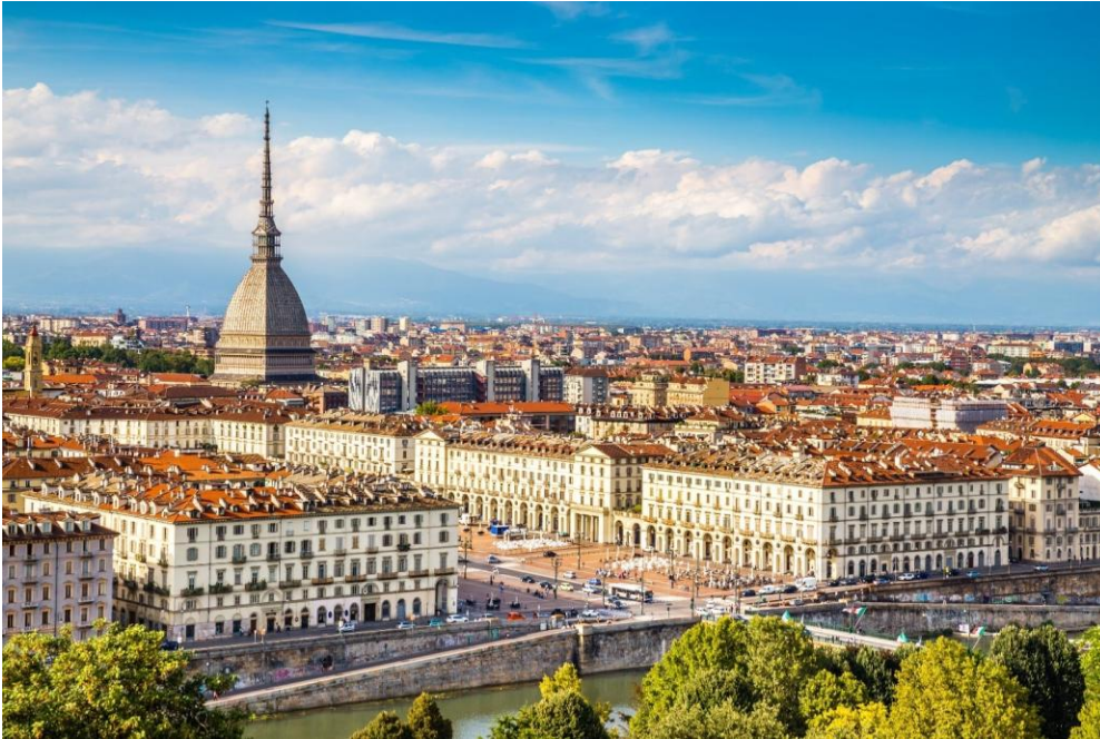
Figure 1 - Piazza Vittorio Veneto and "La Mole" where the Cinema museum is located.

Dates: 7 th April 2025 – 8 th April 2025 in Turin, Italy