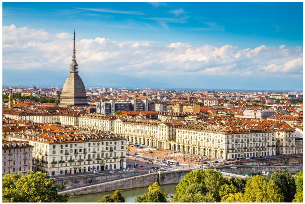
Figure 1 - Piazza Vittorio Veneto and "La Mole" where the Cinema museum is located.

Remember to use the digital badge you received online, show it from your cellphone to the tourism office to receive discounts.